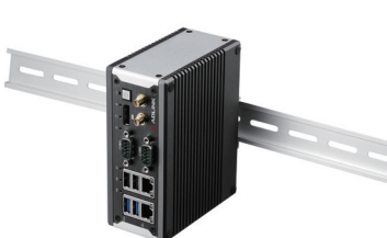
DIN Rail support