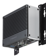
Wall Mounting support (Optional)